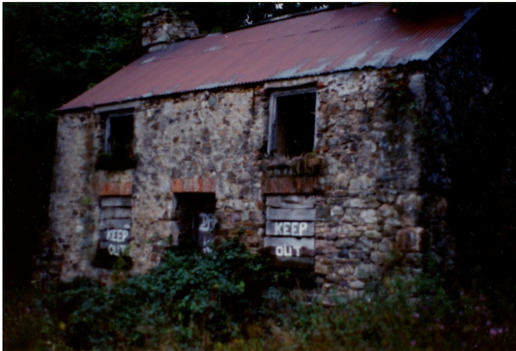
Photograph: Stooper Mill in the 1970s. Ron Dennis

Stooper Mill 1 was one of four mills along Brandy Brook between Hayscastle and Roch Bridge, using water power to grind corn. The only one of the four now remaining is Roch Mill, which has been fully restored, and Stooper Mill was about three miles further up the valley on what is now Brandy Brook Caravan and Camp Site. It was demolished by the site owners in the late twentieth century as the building was in disrepair and considered hazardous.