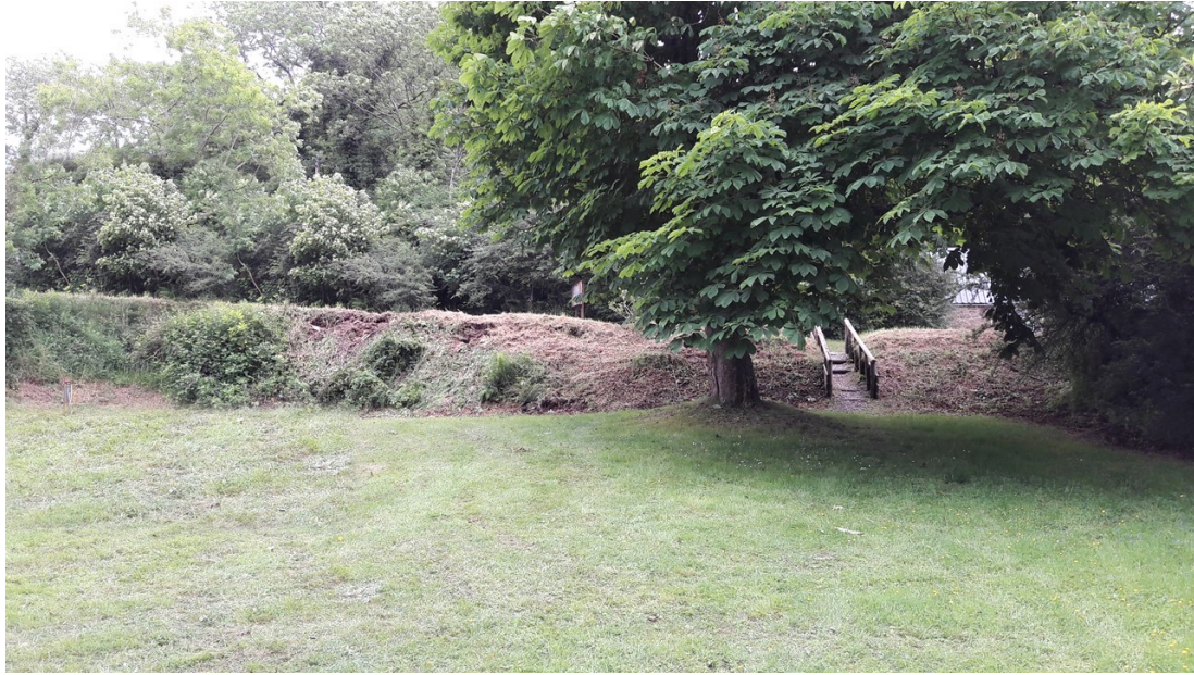
Photograph: Location of now demolished Stoper Mill.